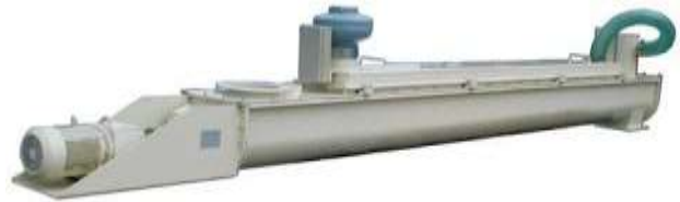
mixing and heating screw