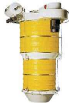
truck loading device